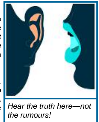
Hear the truth here—not the rumours!

Rank to Role and the rewriting of the grey book. This is something we represent you on. However, most agree that as far as moving from rank to role there will be little change to those on active firefighting duty and changes will affect those further up the tree. However, we will be keeping a close eye to ensure that nothing detrimental slips through and that due consideration for Retained Duty System Firefighters will be made.